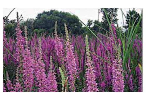
Purple Loosestrife grows in all kinds of wetlands, from marshes to the ditch along the road.

How? Search for Tomahawk Lake Association on Facebook, click on the page and hit join. You will then be approved by one of our Facebook page administrators and ready to see all notifications from other members. Then share your own posts with TLA and more people will be in the loop and enjoying notifications of happenings on Tomahawk Lake. You can also go through your own Facebook contacts and invite your friends to join the TLA site. Awareness is key to our social media site so all can enjoy the benefits of the notifications. Tell your friends and neighbors today!