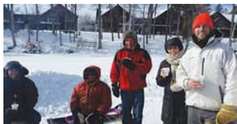
Skates, Snowshoes & Skis Event on February 14. Brave souls ventured out despite the -41° windchill. Warm cocoa and a hot fire helped!