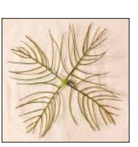
Northern Water Milfoil