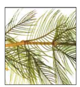
Eurasion Water Milfoil

Because Northern Water Milfoil has been classified as a Wisconsin native plant species by the WDNR, there are no approved treatment protocols for this plant. Neither chemical treatments nor aquatic plant harvesting permits have been granted to control Northern Water Milfoil.