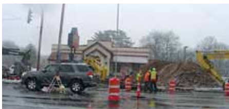
Intersection of Hwys. 70W & 51N

This year's project includes the revamping of the junction of Hwy. 51 and Hwy. J; revamping the intersection of Hwy. 51 and Hwy. 70W; and the continuation of reconstructing and updating Hwy. 51 from McDonald's to Hwy. J. Hwy. J will be updated from Hwy. 51 to Hwy. 47.