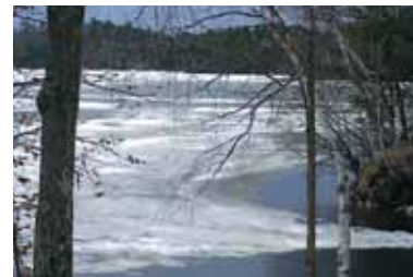
Northwest shoreline...melt starting

As I write this on St. Patrick's Day the snow and wind are blowing, accumulations of 5-8 inches are expected and the wind chill temp is around zero. The Farmer's Almanac is calling for a total of 30 inches