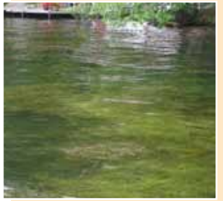
Southern Naiad below the surface of the water

Wisconsin Trout Lake station and the Wisconsin