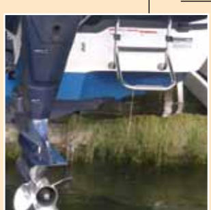
Southern Naiad collecting on boat lift

I wish I had better news about our Southern Naiad problem. TLA will stay on the case and continue working with the WDNR on steps forward.