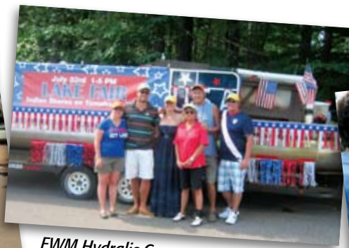
EWM Hydraulic Conveyor System decorated for the July 4th Parade