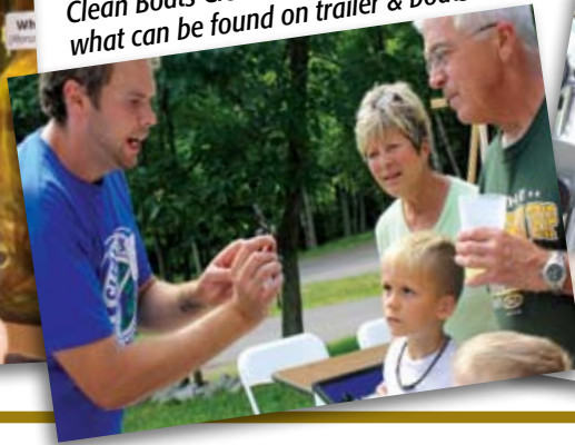
Lake Fair – Clean Boats Clean Water DNR rep shows what can be found on trailer & boats.