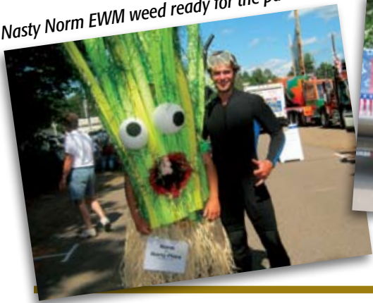
Nasty Norm EWM weed ready for the parade.