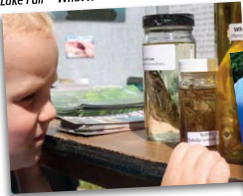
Lake Fair – What IS in that bottle??