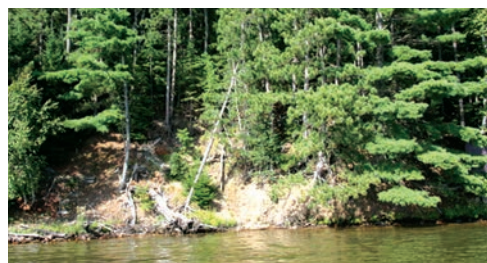
GULLY EROSION TO LAKE