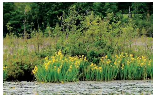
YELLOW IRIS – INVASIVE SPECIES (IRIS PSEUDACORUS) – REACHES 4-5 FT. TALL

If you would be interested in having our consultant provide you a complementary site evaluation of your property or would be interested in having your property be a shoreland demonstration site, please contact Jim Kavemeier at 262-5420212 or jimkavemeier@mac.com .