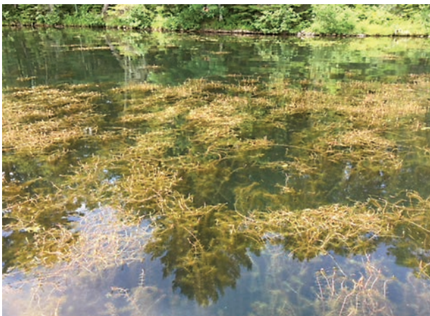
A STAND OF EURASIAN WATER MILFOIL IN ONE OF THE LAKE'S BAYS.

There are of course a number of compelling reasons to limit the long-term use of chemical herbicides within the lake environment , and I would refer you to last year's spring and fall newsletters (available on www.tomahawklake.org ) to gain an understanding of the downsides of chemical herbicides. Almost all of the information—which has been published about the negative effects of aquatic herbicides—has been done with systemic herbicides, and specifically with 2,4-D.