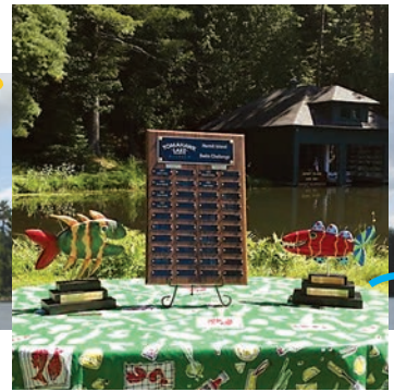
Awards and Plaque!

The Hermit Island Swim Challenge has a new name... the Hermit is ecstatic about the new name... Hermit Island Swim & Paddle (HISP)! This new name accommodates all of the divisions present at the race. The Hermit loves all the paddlers we have gained over the last couple years and has decided there will be a traveling trophy for the paddle division starting this year and going forward.