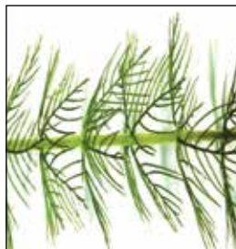
Northern Water Milfoil