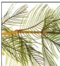
Eurasian Water Milfoil

Because Northern Water Milfoil has been classified as a Wisconsin native plant species by the WDNR, there are no approved treatment protocols for this plant. Neither chemical treatments nor aquatic plant harvesting permits have been granted to control Northern Water Milfoil.