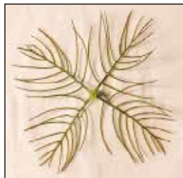
Northern Water Milfoil