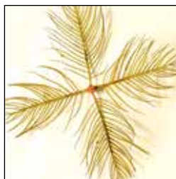
Eurasian Water Milfoil