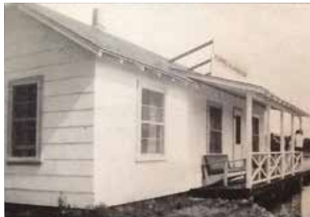
KLIPPEL'S LANDING c.1946