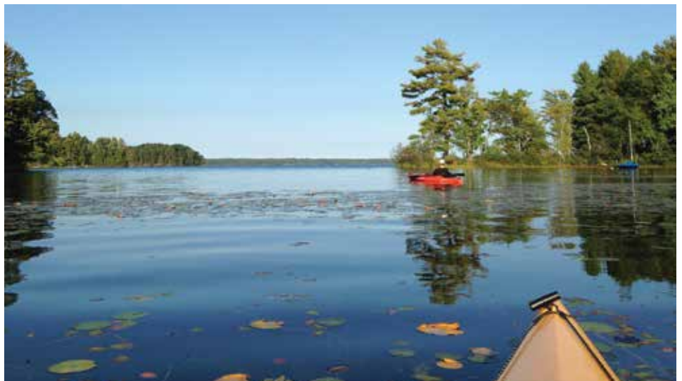
BLUEBERRY BAY ON THE WESTERN SHORE

• We will continue to aggressively monitor the size and shape of our EWM infestations over the course of the summer seasons. I have applied for and received a WDNR shared grant to cover the cost of continued plant surveys which we have historically done.