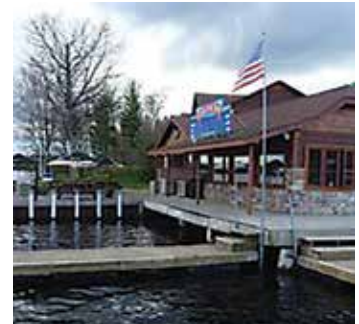
(Before) LAKESIDE GRILLE