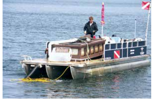
HYDRAULIC CONVEYOR SYSTEM AT WORK

Every spring, TLA hires four summertime employees who work throughout the summer months, doing a number of jobs in support of TLA projects. Over the years, we have been blessed with good employees who work hard on our Clean Boats Clean Waters boat ramp education program and on our Hydraulic Conveyor System (HCS) suction harvesting boat.