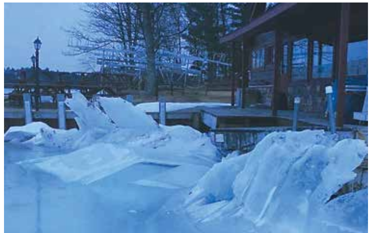
(After) SPRING 2017 ICE DAMAGE AT LAKESIDE GRILLE